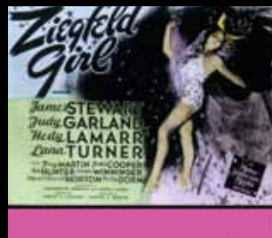
Coming Attraction Slide