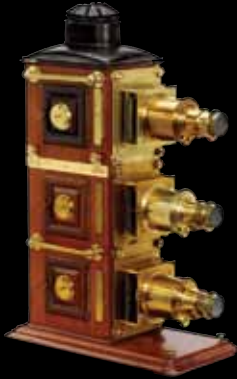
Tri-unial Lantern 1890's