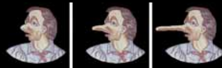
Slip slide animated sequence

The heyday of the magic lantern in the US and elsewhere was mid-to-late 19th C. For audiences that had never seen a movie, watched tv, or experienced the internet, projected slides were a wonder. Slides were often dramatic, detailed, and colorful.