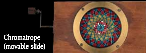
Chromatrope (movable slide)